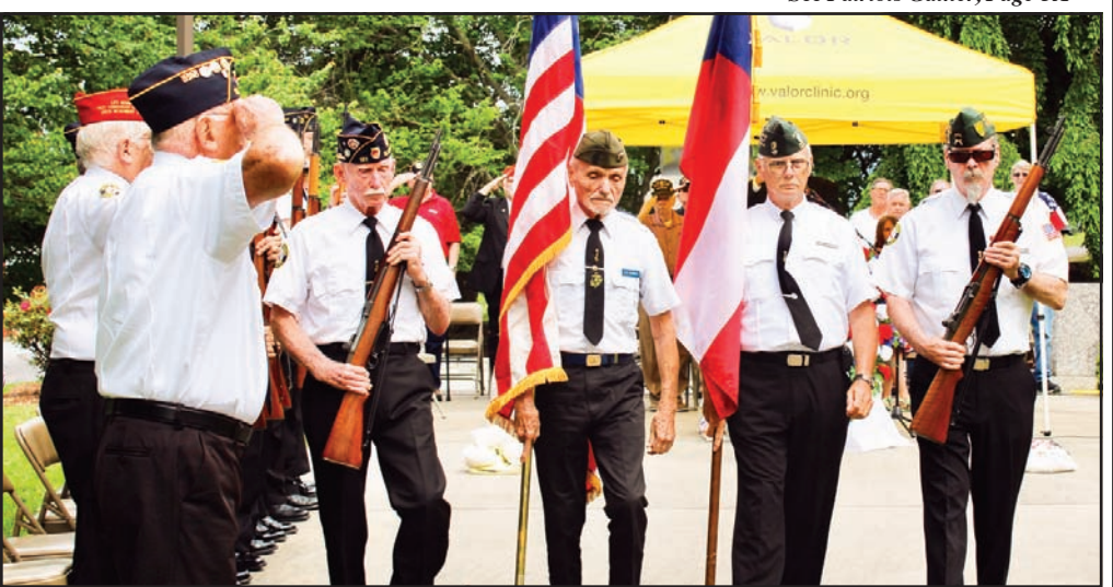
The North Georgia Honor Guard retired the colors at the end of the May 29 Memorial Day Ceremony at War Memorial Veterans' Park.